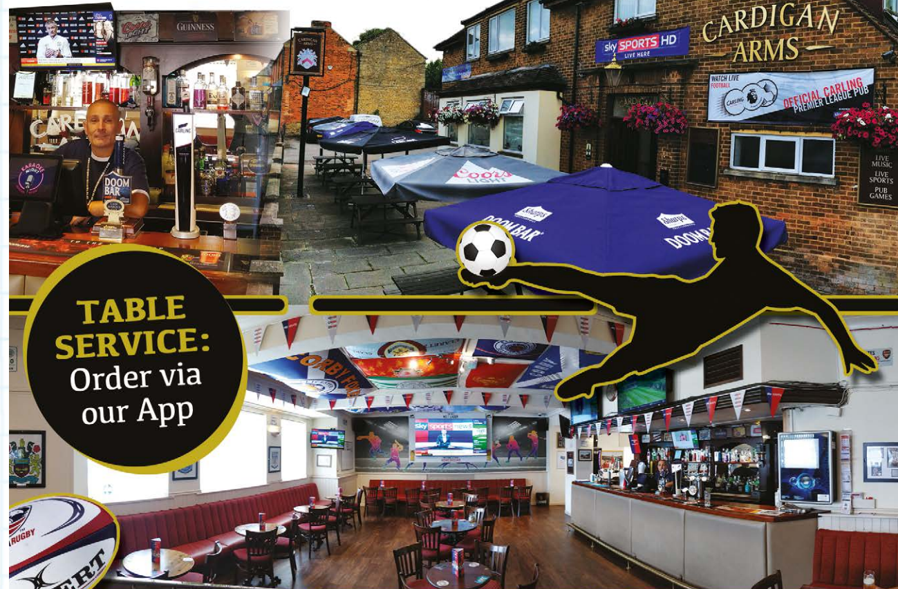
TABLE SERVICE: Order via our App